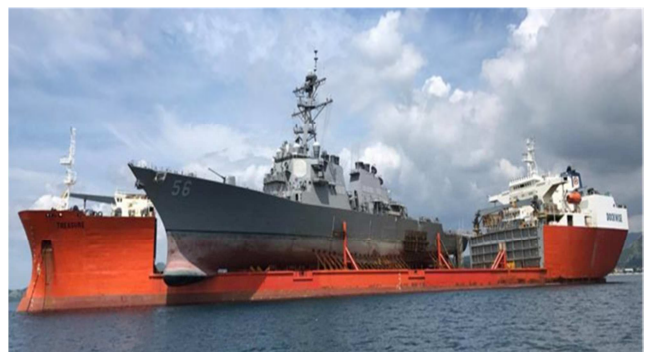
Figure 2. Incident involving USS John MacCain demanded use of HLS.

The costs associated with rescue operations and transport of military assets vary according to the complexity and availability of the HLS suitable for use. Studies carried out by the Center for North American Naval Projects (CISD) indicate that approximately US$ 5.1 million was spent on the transport of the destroyer USS Cole, the target of a terrorist attack in Yemen on October 12, 2020. On October 11, 2017 A collision with a merchant ship resulted in serious damage to the destroyer USS John MacCain, costing about US$ 4.5 million to transport the medium that was east of the Straits of Malacca to a repair shipyard located in Singapore. It is worth noting that such maneuvers avoided the loss of said means, valued at approximately US$ 700 million and US$ 500 million respectively.