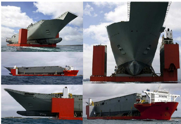
Figure 1. HMAS Canberra being carried by HLS.

Regarding logistics, the operation of a Semi-Submersible HLS meets numerous transport requirements. Such vessels are capable of docking and transporting other vessels in different operating conditions, being able to carry out support missions and transport of materials of the most varied types and characteristics. In practical terms, it would be possible, for example, to use this class of vessel for humanitarian