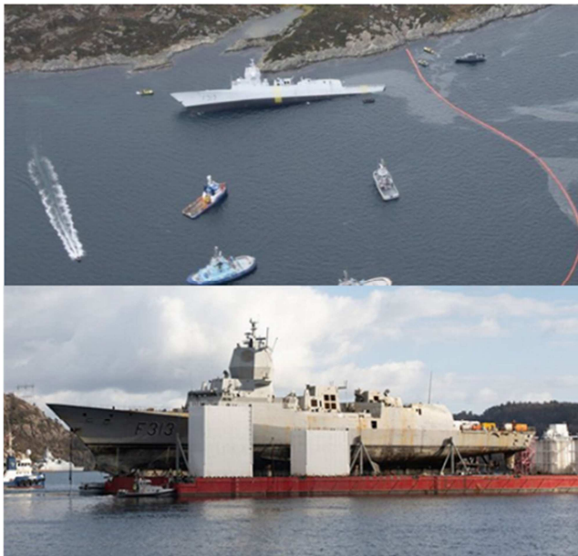
Figure 3. Collision of Frigate Norwegian Warship HNoMS Helge [7].

Another incident involving a military ship took place in November 2018, where a tanker collided with the frigate HNoMS Helge Ingstad belonging to the Royal Norwegian Navy which was returning to its base after carrying out exercises, however there was no time to rescue the medium, which resulted in its loss generating an estimated loss of around US$ 1.4 billion, the ship in question had less than 10 years of activity. Such occurrences are faced with the level of risk linked to the operations involved to rescue the damaged environment, which requires an entire rescue logistic structure involved.